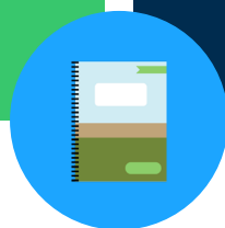
Direct Instruction Materials