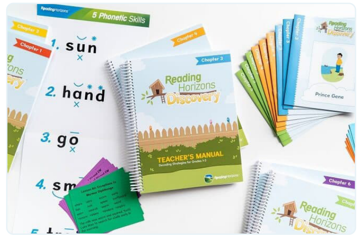
Reading Horizons Discovery ® Grades 1–3 Teacher's Kits

Teachers reported it was an easy program to implement because the instructional guidance seamlessly deepened their knowledge about the science of reading in an explicit, systematic approach to phonics instruction.